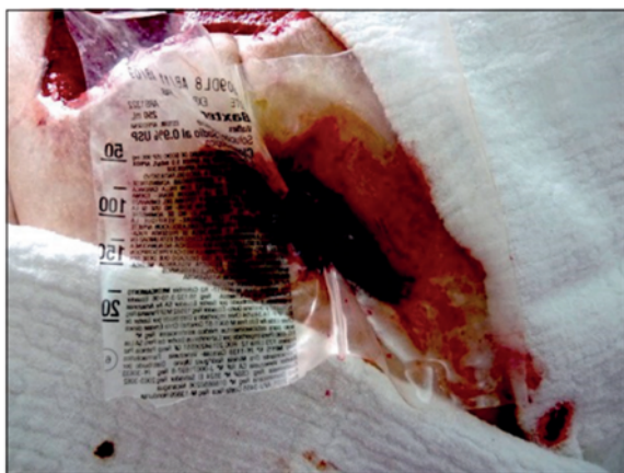
FIGURE 3: Floating stoma. Neopared separating fecal production and peristomal space.

for the use of BB and FS was abdominal sepsis due to secondary peritonitis due to rupture of hollow viscera (69.6%), EDC due to abdominal trauma (17.4%) and mesenteric ischemia (13.0%) (10). The stoma that is often required in these emergency situations is sometimes quite difficult to model due to mesenteric retraction, significant abdominal swelling, and / or intestinal distention (14). Vergara et al. They report a case report of a 58-year-old woman who was found to have acute Hinchey diverticulitis type III of the sigmoid colon, for which they performed a sigmoidectomy and Hartmann-type colostomy. On the sixth postoperative day, he was admitted for multiple intra-abdominal abscesses and peristomal abscess, so it was decided to perform a neopared with Viaflex® (Baxter Healthcare Corporation to fix the ostomy, everting its production on the new wall, limiting the drainage of fecal matter into the pockets periostomales, which is called “floating stoma” (Figure 2) (9).