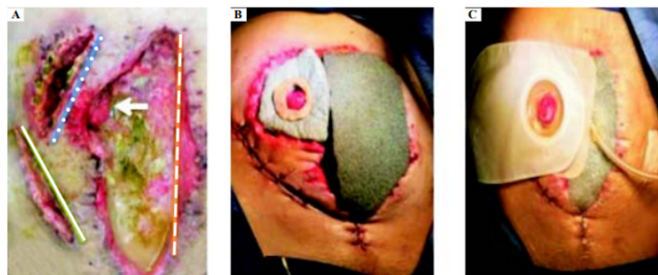
FIGURE 4: A. Initial appearance of the abdomen. Mc Burney incision for appendectomy (solid line): stoma site (dotted line...). Wound in the midline supra and infraumbilical (intermittent line). Retracted stoma (arrow). B. Design of a floating stoma using a vacuum assisted closure system. C. Finished floating stoma.

In the report by Ramirez et al. They indicate that the floating stoma is an alternative for the control of abdominal sepsis in the open abdomen with stomal retraction, in the case of a 39-year-old man with open appendectomy for acute appendicitis. Finding data of sepsis, open abdomen, retracted ileostomy and skin conditions. They performed surgical lavage, floating stoma, and placement of a vacuum-assisted closure system, with adequate results after placement, allowing control of sepsis and favoring early closure of the abdominal wall (Figure 3) (1).