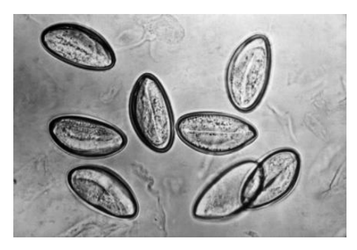
Figure (1) Enterobius vermicularis egg in stool sample is detected microscopically.

The fully embryonated eggs are infective to man. The eggs are colorless, measuring about 50to60 microns in length and 20 to32 micron in breadth. The appearance is plano convex, one side is flattened and the other is convex. The shell are transparent, thin, hyaline, composed of two layers of albumins material. The egg stage when laid contains a full developed coiled larva and become infective to humans within six hour after exposure to atmospheric oxygen. Eggs of Enterobius vermicularis more resistant to antiseptics and can floats in saturatedsaltes solution (Cook G,1994).