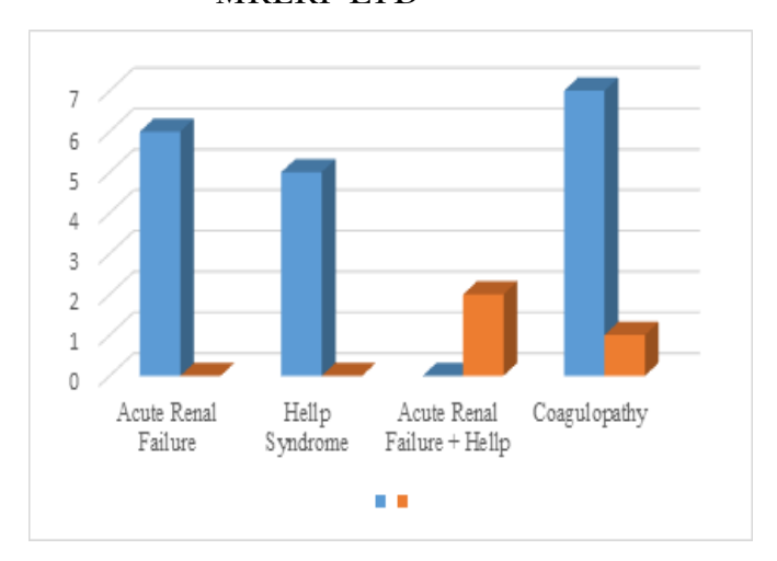
FIGURE 2: Number of complications evolution: Favorable death.